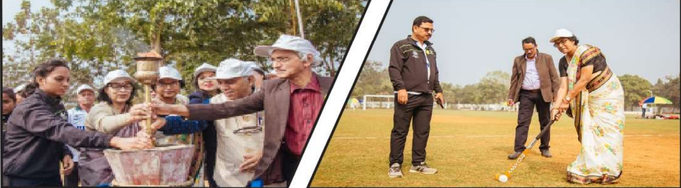
Igniting the Hockey Spirit